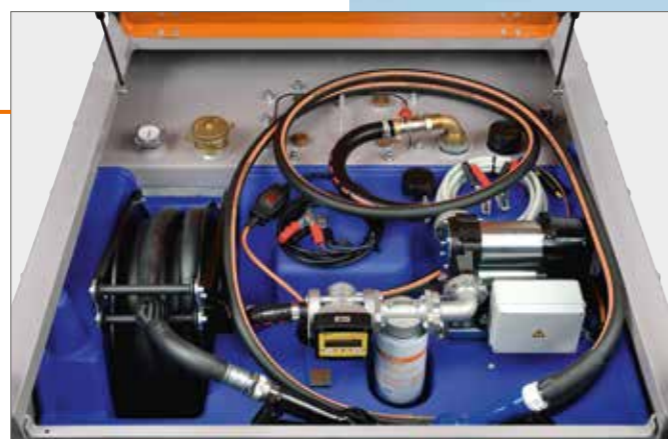
All fittings are on the inside and thus protected.